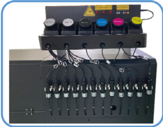
White ink stirring system, to avoid white ink clogging at print heads, ink shortage alarm system;