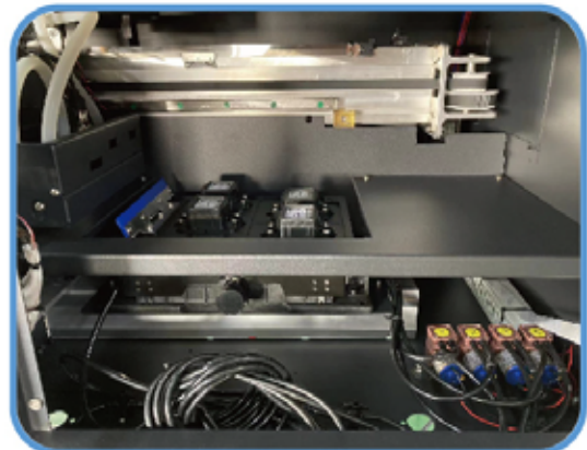
Stable Hoson electronic board with auto cleaning system.