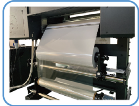
Automatic peel off the film from printing glue film, printing film can be white, silver and gold color film;