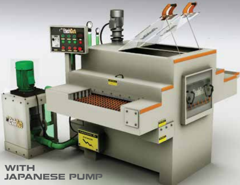
WITH JAPANESE PUMP