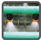
65 degree Jet with PPR fittings