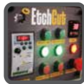
Digital Conveyor by Delta Drive system -Taiwan