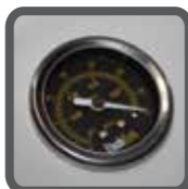
OEM Designed Vacuum gauge