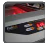
Automatic Programmed Digital control panel