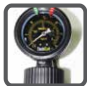
OEM Pressure Gauge from Korea