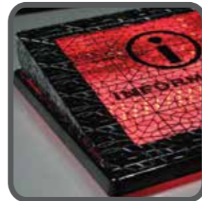
Backlit with LED