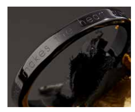
Personalizing and engraving jewelry