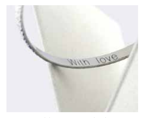
Personalizing and engraving jewelry