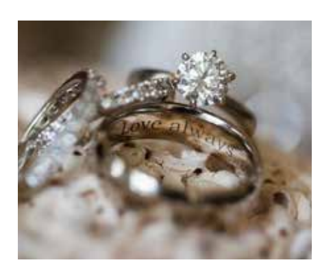
Personalizing and engraving jewelry