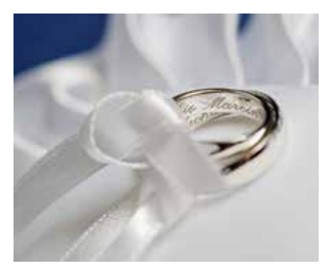
Personalizing and engraving jewelry