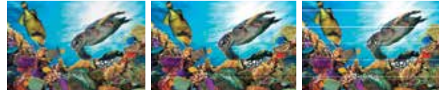
Incorrect bi-directional drop landing position Overlap / black streaks (Insufficient paper feeding) Gap / white streaks (Excessive paper feeding)

* DAS may not be compatible with some media such as coloured, transparent, and embossed substrates.