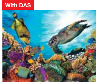
Correct drop landing position and paper feeding ensures the highest print quality